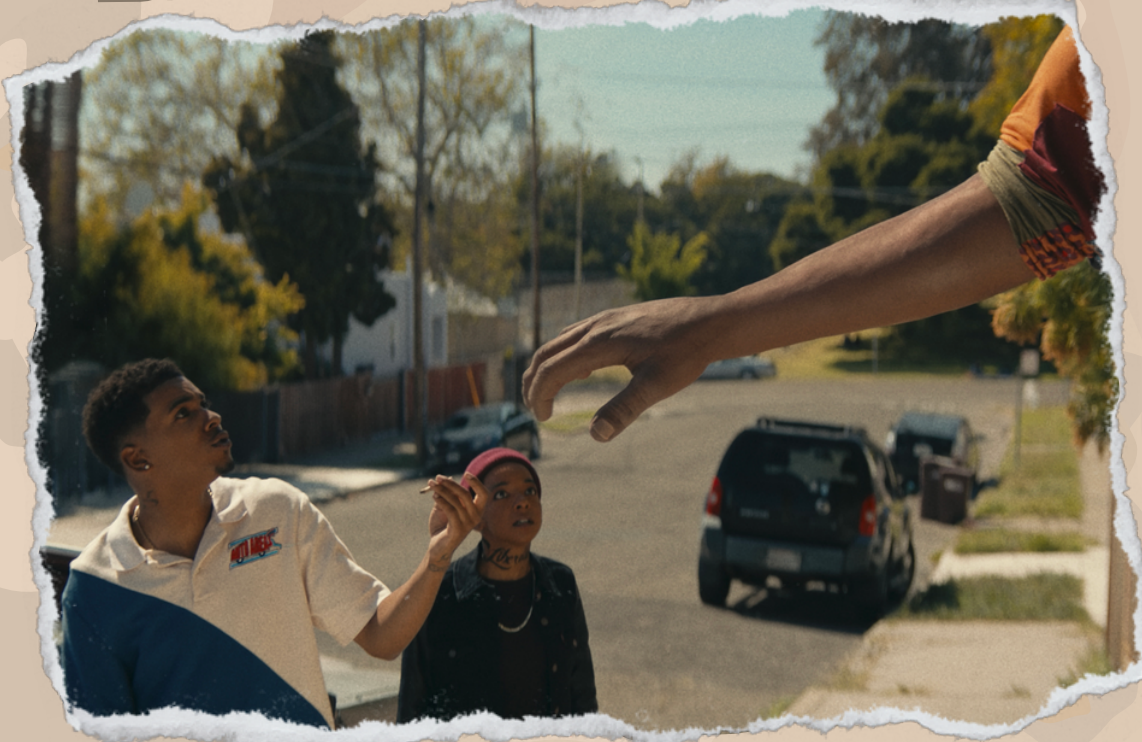
I'm a Virgo