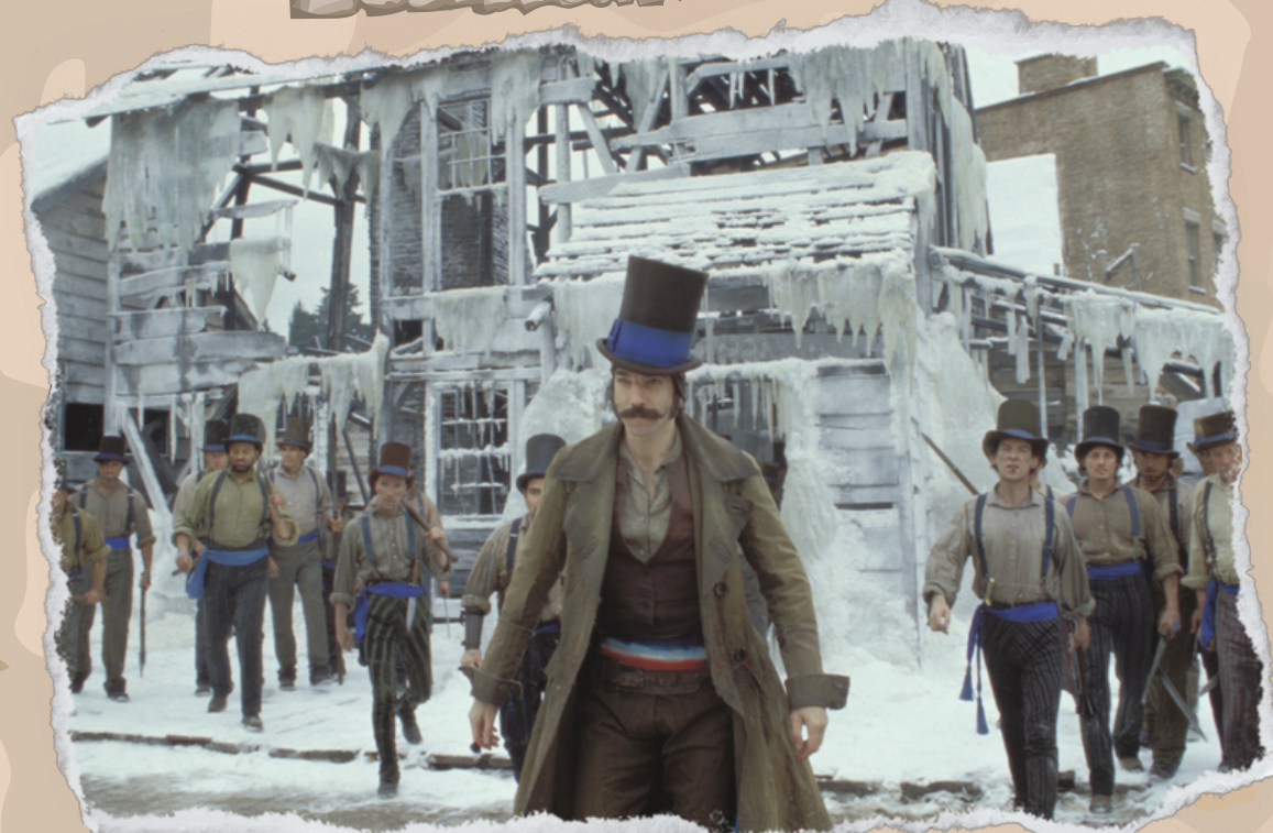
Gangs of New York