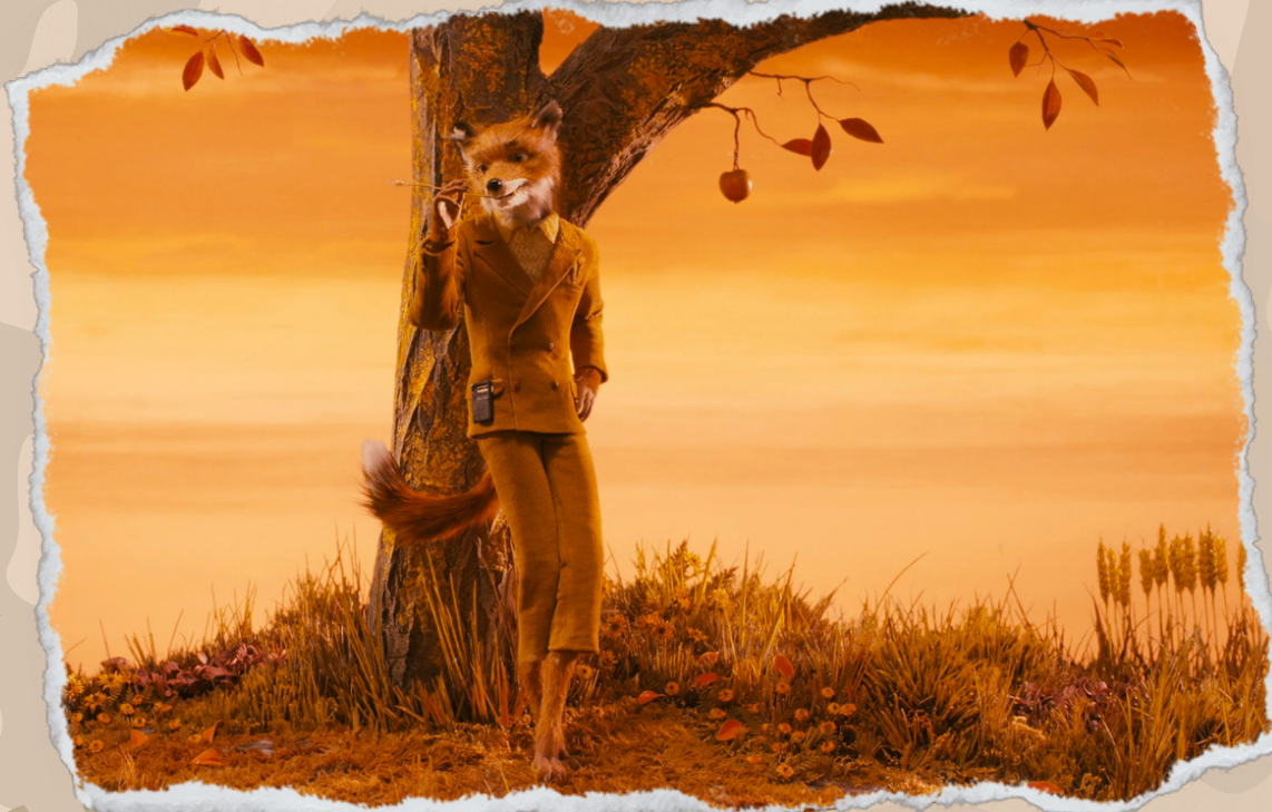
Fantastic Mr Fox