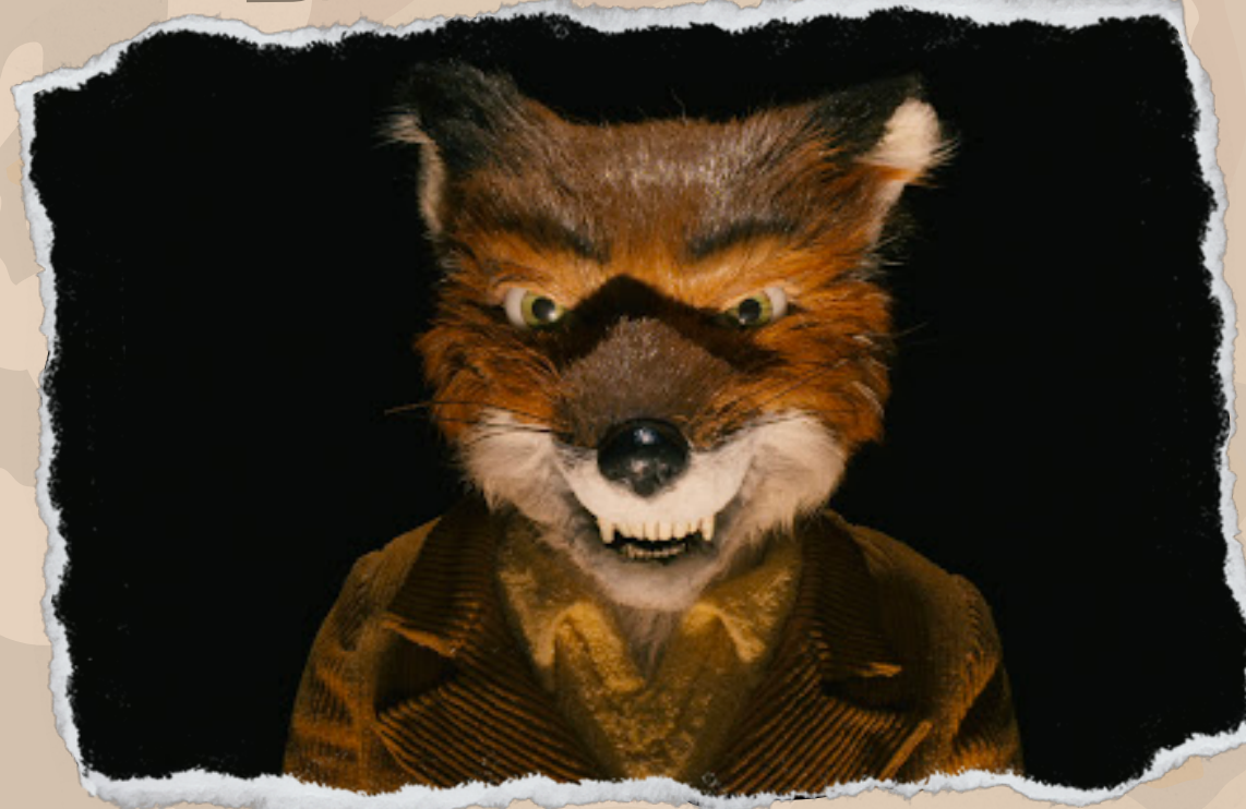
Fantastic Mr Fox