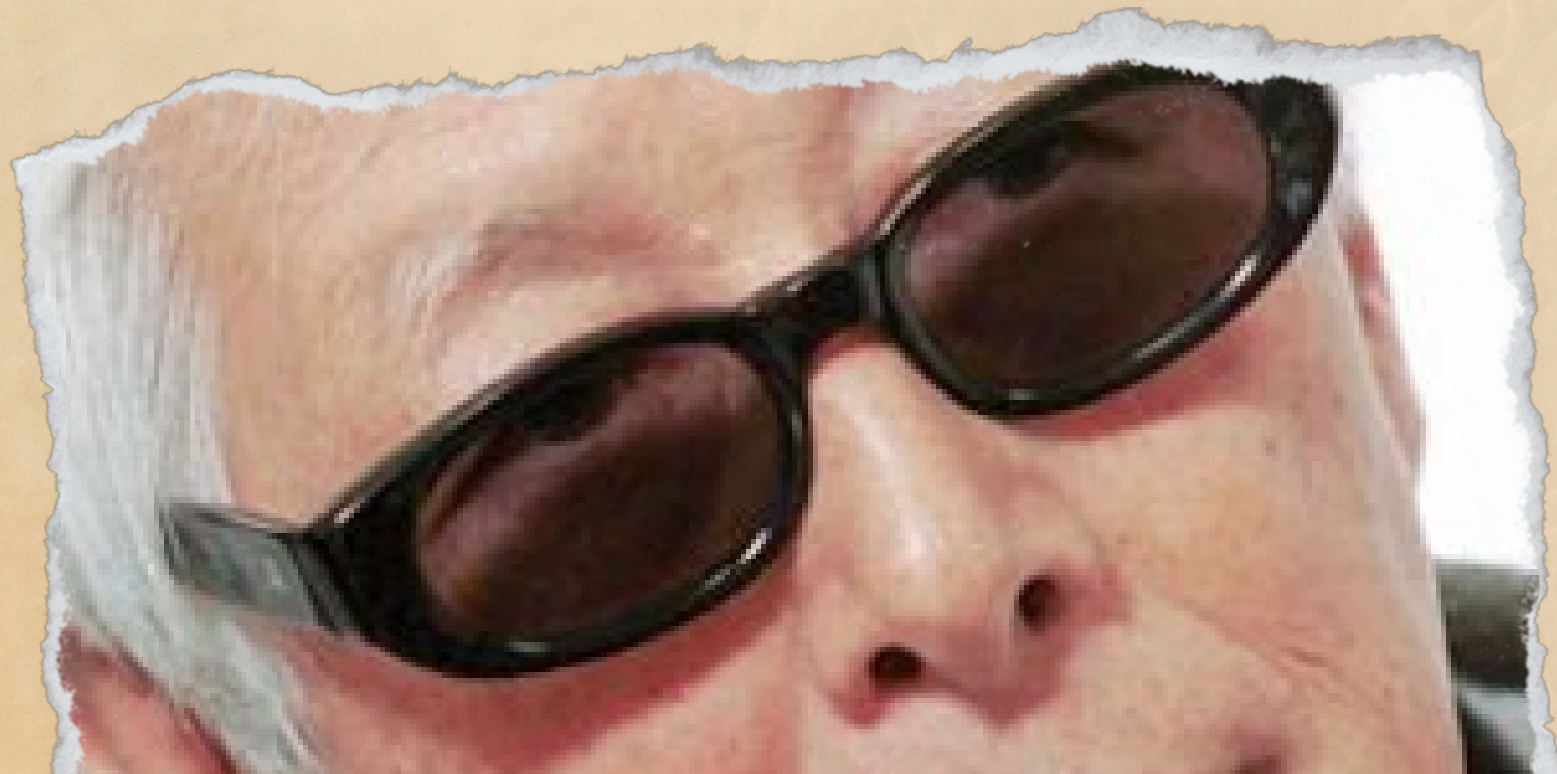
Kinji Fukasaku, Martin Scorsese

The film employs traditional techniques like smooth motivated camera dolly and intricate blocking. It showcases authentic period attire and props, aiming for in-camera effects when possible, and resorting to compositing only when necessary. The narrative incorporates elements of body horror and jump scares for added impact. Color skews natural.